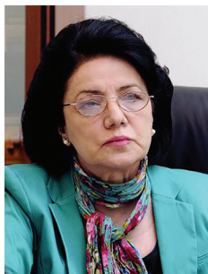
Firangiz Aliagha Alizadeh

President of the National Academy of Sciences of Azerbaijan