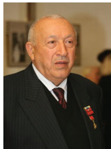
Tahir Teymur Salakhov

Chairman of the Azerbaijan Union of Composers, People's Artist