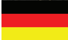
Germany branch (22 January 2017) Birgit Weisgerber