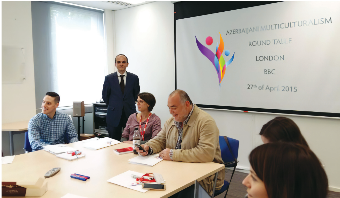
Round table on Azerbaijani multiculturalism on the BBC channel in London on April 27, 2015