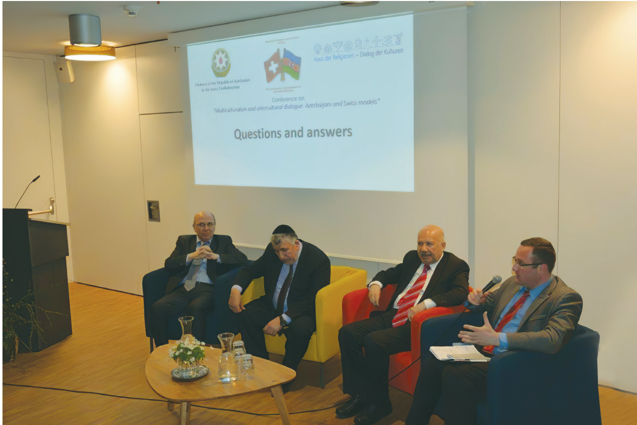
Swiss Conference - Geneva, March 29, 2015. International Conference "Common values of multiculturalism and secularism in Azerbaijan and Switzerland".