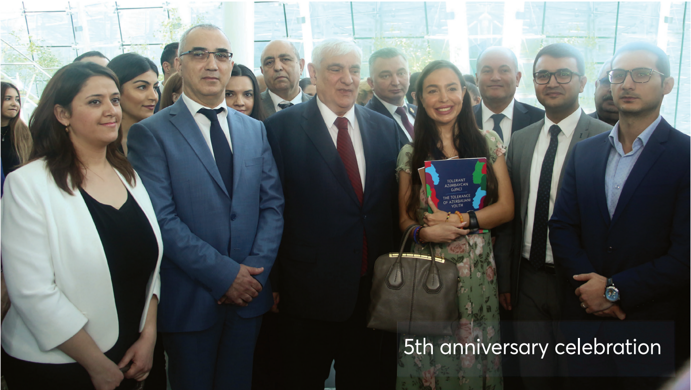
5th anniversary celebration