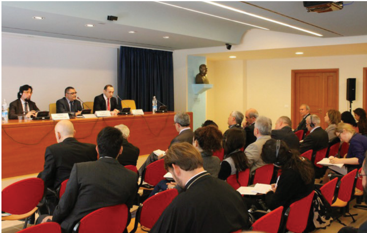
Rome Conference - International Conference "Azerbaijani Multiculturalism and Caucasian Albania: the Udis" on April 21, 2015 at the Pontifical Salesian University, Rome.