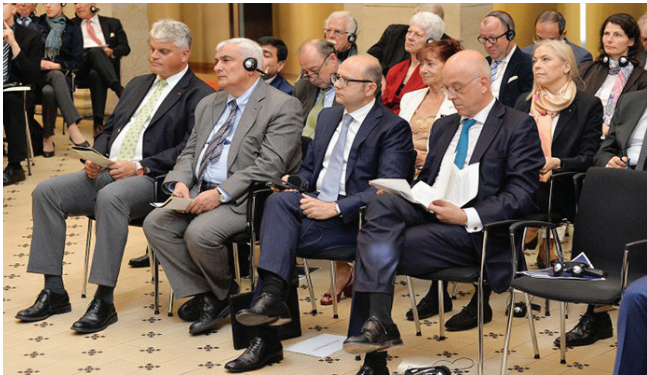
Berlin Conference - International Conference "Azerbaijani Multiculturalism: Historical Experiments and a Model of the Future Society" jointly organized in Berlin, the Federal Republic of Germany, by the Baku International Multiculturalism Centre (BIMC), the German-Azerbaijan Forum, the Embassy of Azerbaijan in Germany and the Humboldt University of Berlin.