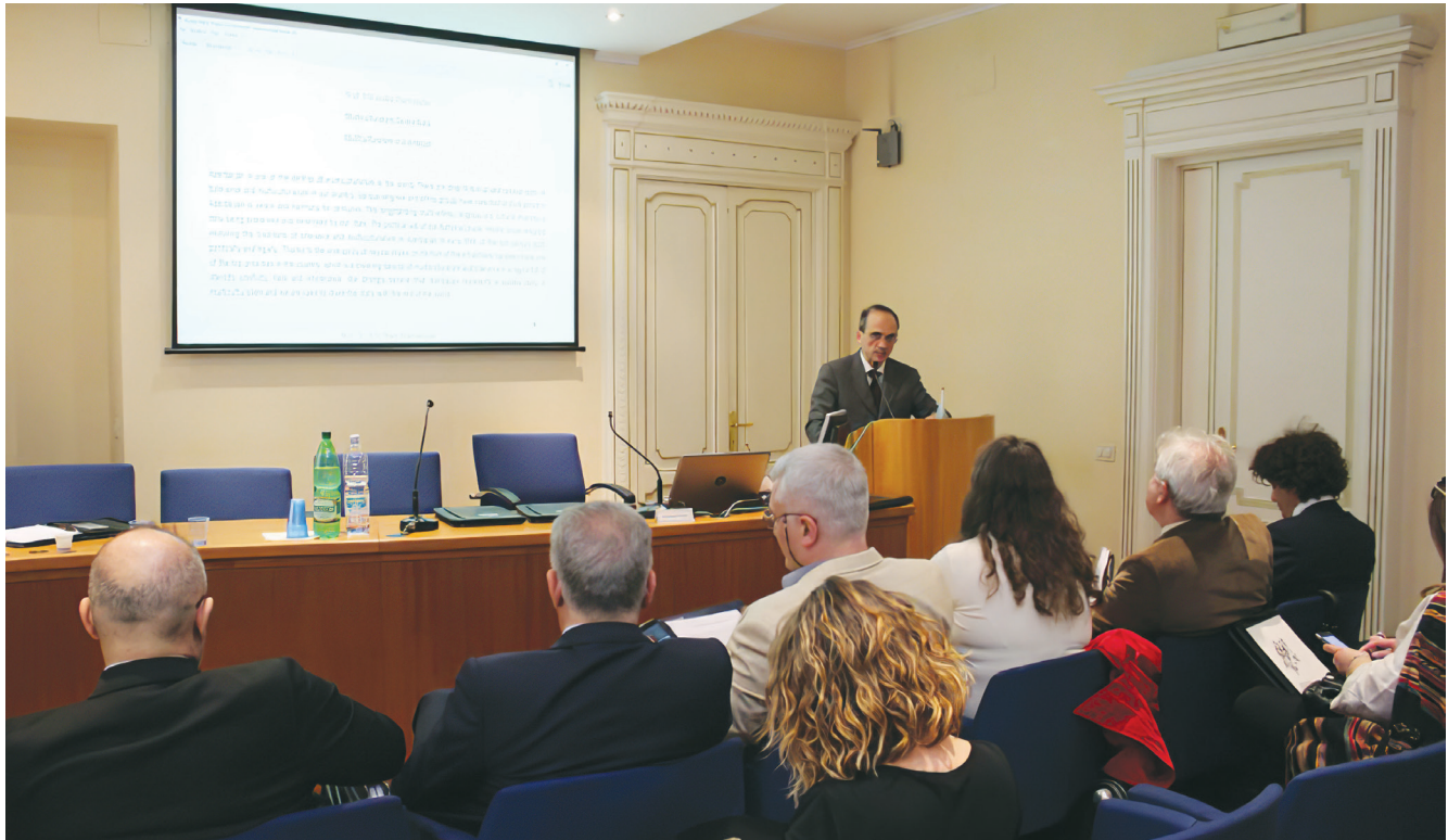
Round table in Rome - an event held in Rome as part of the First International Scientific Conference "Heydar Aliyev: the Ideology of Multiculturalism and Tolerance" dedicated to the 95th anniversary of the national leader Heydar Aliyev.