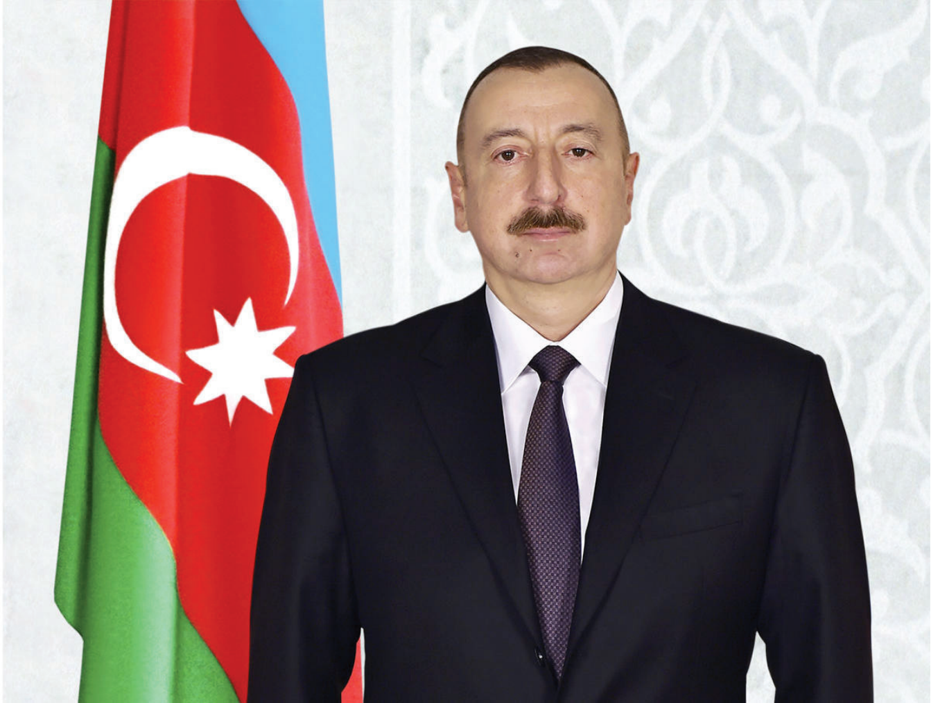
President of the Republic of Azerbaijan ILHAM ALIYEV

“Multiculturalism is a state policy in Azerbaijan, and at the same time, it’s our lifestyle.